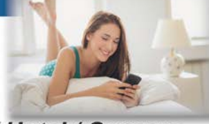
Camping Site / Hospital / Hotel / Campus